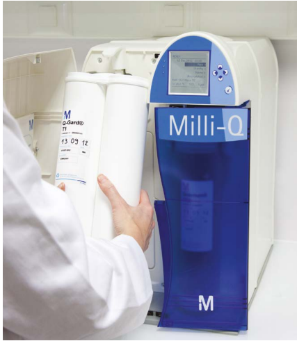
Q-Gard® Pretreatment Pack

Maintaining the Milli-Q® Reference system won't take time away from your research. Maintenance frequency is minimal, and the procedures are simplified to the utmost.