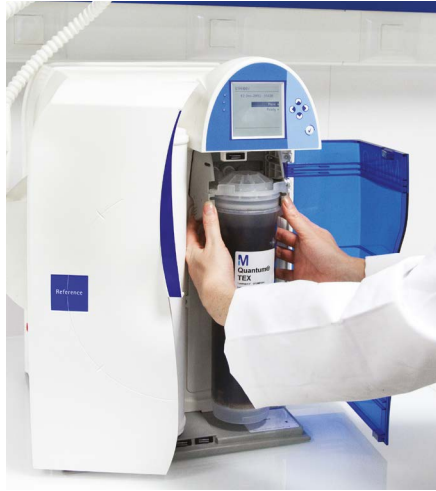
Quantum® Polishing Cartridge